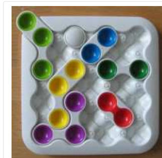
Time Solutions: shame to admit

Tasks from the starter solved in less than 40 seconds, with subsequent levels of the time is lengthened. Tasks solved with an expert level on average in about 2 minutes. However, already at this level there are tasks that were difficult. The next level will not say, because time resolution moooooo somehow extended. Especially at the level of the wizard. Solving is subjective. Everyone does it differently and with different speed. Time measured only out of curiosity, but on the last page of this manual is a place for his quotation. It is against the dissolution of each task, take a moment to analyze: where to move the molecule, which is the first move, you can move the whole group of molecules (traffic allowed). If you are present on the board stationary items, you need to think which way the virus can be derived, as they restrict the movements of other elements, particularly large ones.