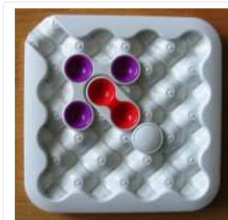
The solution time: 7 sec