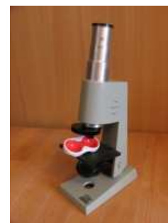
And I became a virologist

Of all the puzzles in a series SmartGames that resolved, I like best is just Antivirus. Not just me. Topics suitable for the mechanics, the elements are well-made, technical solution to how to move items is amazing. Tasks solved with great pleasure, do not get tired, pull. When the solution of the task is hard, man does not become discouraged. Do not even occurred to me moments of frustration. Slightly - nice, hard and too nice. This puzzle is very dynamic, it has no time for boredom is just hard work of the head and hands. Thanks to improve logical thinking, perception, imagination. Therefore, it is a good tool for the older children (as recommended by 7 years of age), of course, also for adults. With full knowledge of the claim that this is a brilliant idea to spend your time. And how creative!